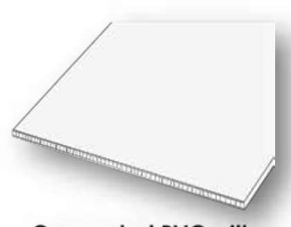
Corrugated PVC with 0.25" Aluminum Skin